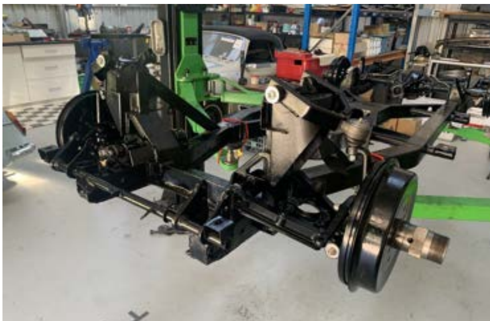
Front suspension, brakes and steering assembled prior to shocks and springs. All new parts.

The current rebuild sequence is to firstly complete all bodywork, then refit to chassis (yet again), swing all repaired panels confirming all correct gaps, leading to a refit to the rotisserie and paint completely in epoxy primer, high-build primer and finally colour (White). Second, is the completion of the chassis hardware such as brake lines, handbrake mechanism, fuel line and the associated miscellaneous jobs.