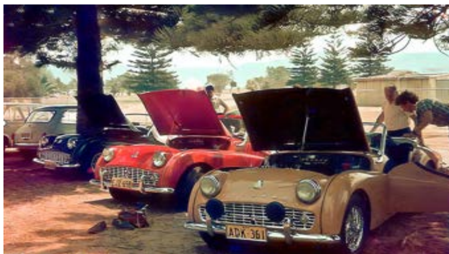
TR at the Concours