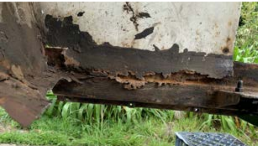
Driver's sides footwell – lots of rust & bad previous repair