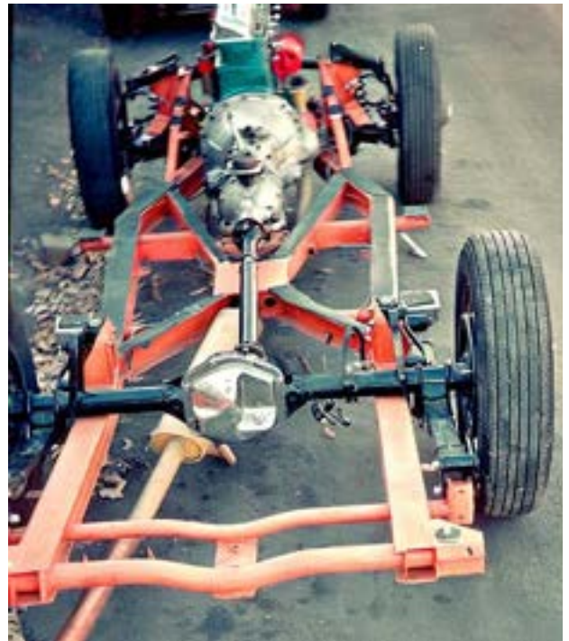
Chrome Diff Cover. Note the towing attachment for my catamaran.

Well - I had at least one unique item on my car: a chrome diff cover. No TR in the history of the world, going back to the Neanderthal era, ever had a chrome diff cover. Anything that could be chromed was chromed: door hinges, oil filter housing, nuts and bolts. You name it! We would work out what we could chrome on the weekend, and my mate Roger would take them away to be done through the week. I think we added about 20 kilos of chrome to the car.