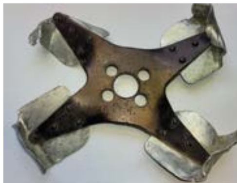
The fan – still hanging in the garage

It appears aluminium and copper radiators show little resistance to cast iron. Here endeth the lesson in physics.