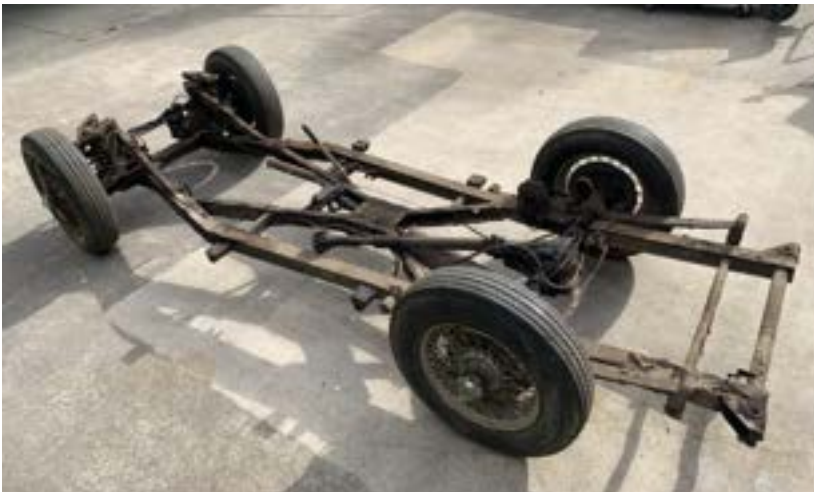
Chassis ready for cleaning to check for damage and sins.