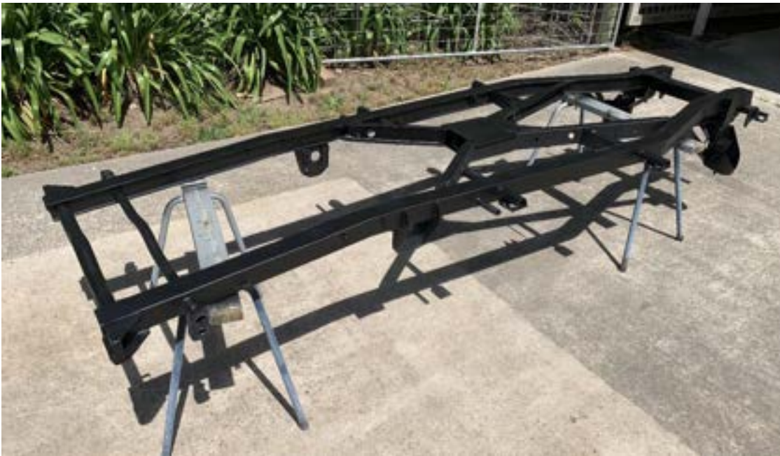
Chassis finished after all repairs. Epoxy primed first, then stone guard in required spots & finally 2k black.