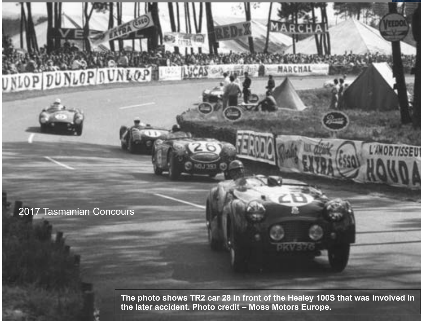
2017 Tasmanian Concours

The photo shows TR2 car 28 in front of the Healey 100S that was involved in the later accident.