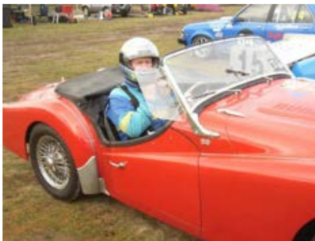
Baskerville Historics 23 September 2017