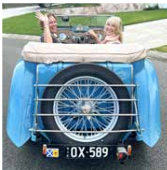
Last TC off the line, 1949

gauge within close limits the speed at which corners can be taken at speed. Today, the TC is recognised for these unique features – a pre war design built post war.