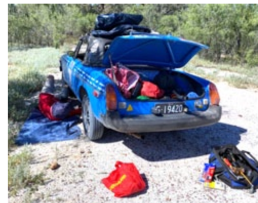
Reattaching the gearbox cross member

The next day we headed for Bourke with the expectation of an easy 3h15m drive ahead of us. Instead, we were advised in Walkett that a bridge was down at Brewarrina so we had to head for the dirt (but very scenic) back roads through Carinda and Gongolgon. On the way, the noise from under Blue B suddenly became strident and the gear shift started jerking vertically upwards. Inspection revealed that two of the bolts securing the side of the gearbox cross member had disappeared and the weight of the gearbox was resting on the exhaust pipe. Fortunately, another easy fix.