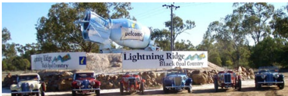
Déjà vu - same backdrop but different miscreants in 2010. Guess who?

Our first rest day was spent relaxing and visiting the Black Hand Opal Mine featuring underground sculptures allegedly produced with just a butter knife and fork over a period of 22 years, in between more-in-hope-than-expectation opal mining, which allegedly generated an income of only $1,000 a year. Certainly, the owner is now doing rather better with his novel tourist attraction.