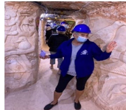
Black Hand Opal Mine

Our first rest day was spent relaxing and visiting the Black Hand Opal Mine featuring underground sculptures allegedly produced with just a butter knife and fork over a period of 22 years, in between more-in-hope-than-expectation opal mining, which allegedly generated an income of only $1,000 a year. Certainly, the owner is now doing rather better with his novel tourist attraction.